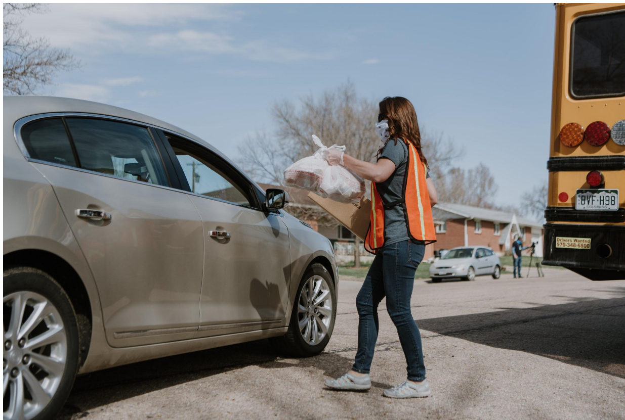
Summer Food Distribution