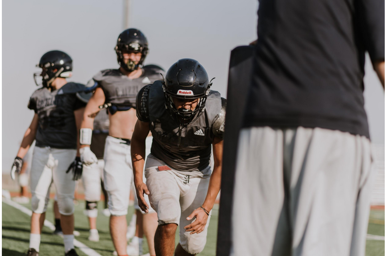
Northridge High School