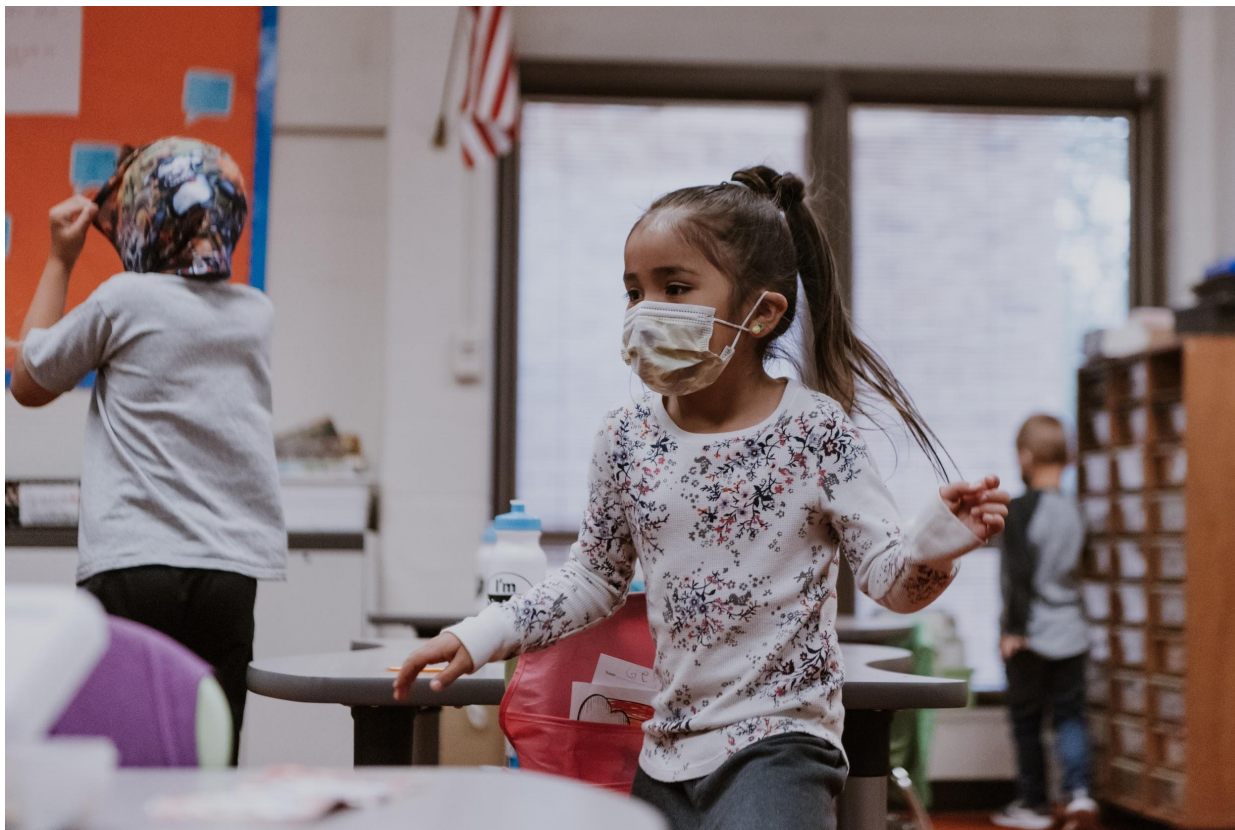
Monfort Elementary School