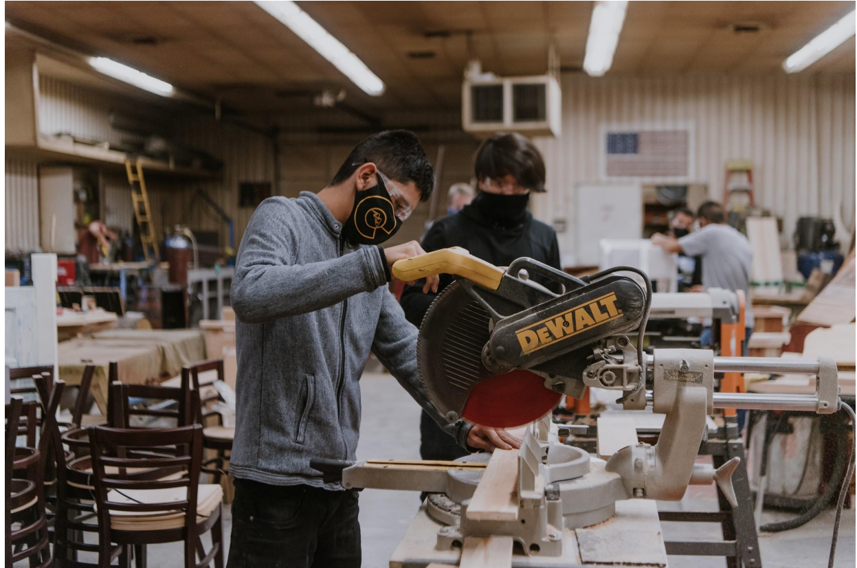
Greeley West High School