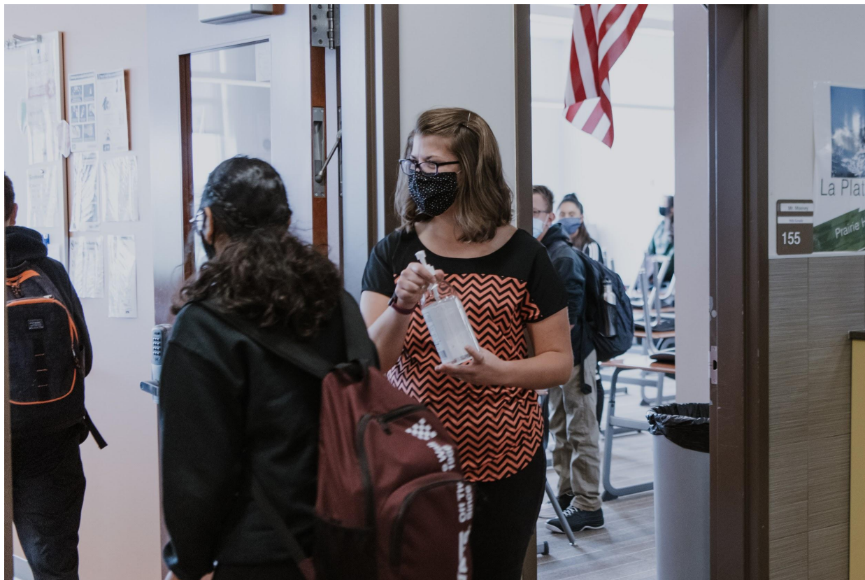
Prairie Heights Middle School