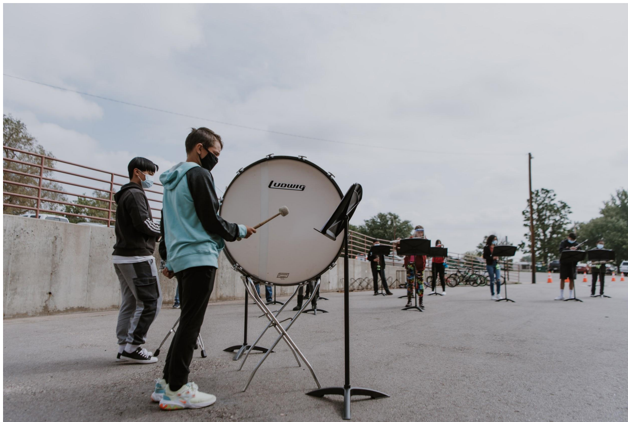
Brentwood Middle School